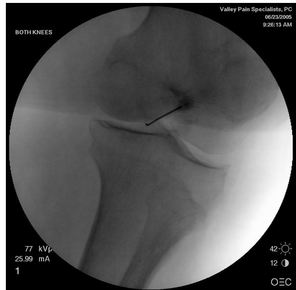
Figure 1. Intra-articular left knee injection

P atients referred to Valley Pain Specialists with hip or knee pain referable to osteoarthritis (OA) who have failed more conservative therapy will be considered candidates for intra-articular injection. Local anesthetics and corticosteroids are commonly injected in an effort to provide both diagnostic and therapeutic benefit. Viscosupplementation of the knee may also be considered in patients with mild to moderate OA. Injections are performed in a relaxed outpatient environment under fluoroscopy.